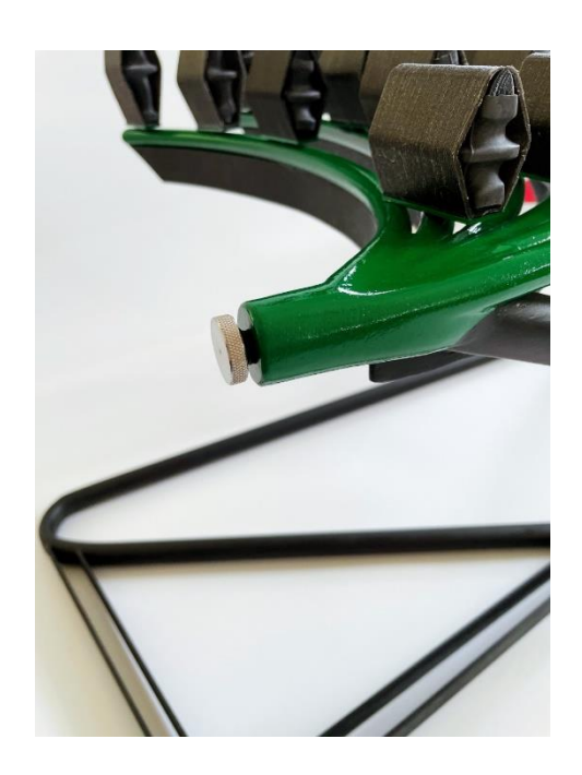
The air cushions hardness is easily adjusted by a scroll wheel.